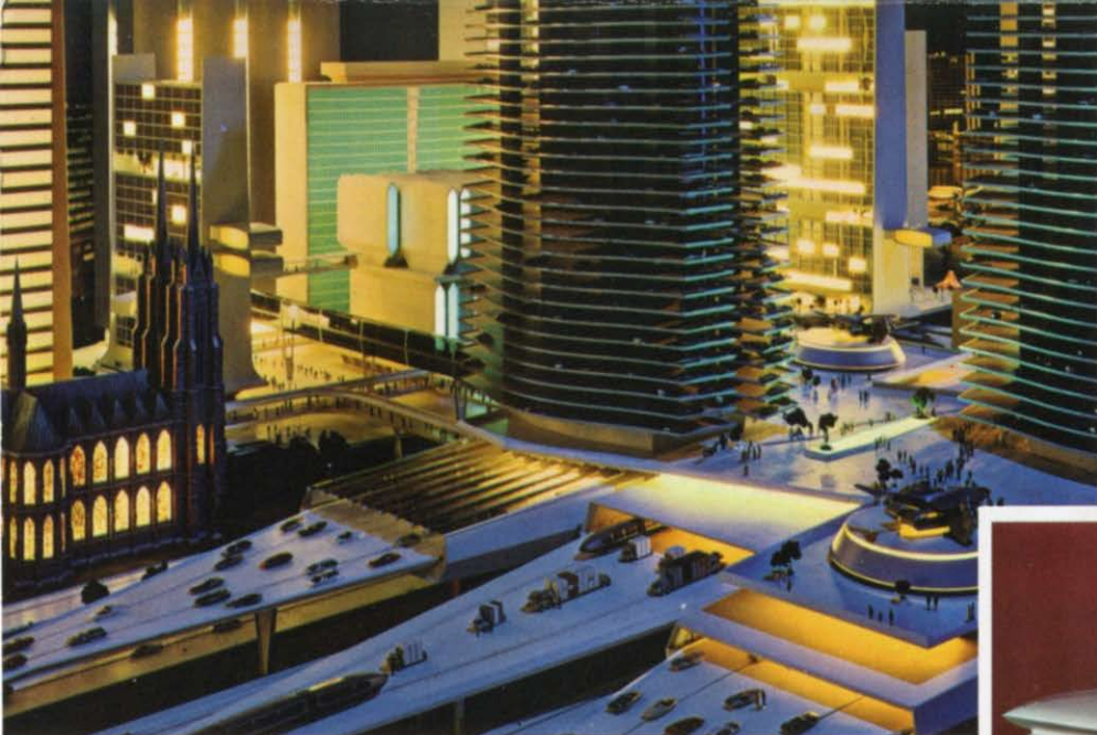
A dynamic new spirit enlivens the "City of Tomorrow." People, vehicles, goods—even some of the sidewalks—are moving. The city, cured of its traffic ills, is reborn as the center of commerce, communication and culture.