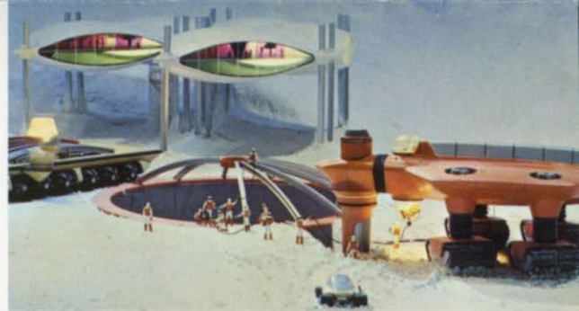
Man turns ice-clad Antarctica into a global weather center and probes its frozen wastes for resources needed by a growing world population.