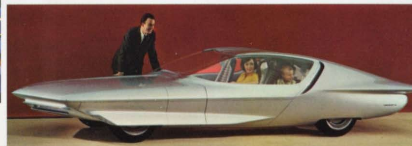
Firebird IV, latest in a series of turbine-driven experimental cars, promises new heights of comfort and convenience in automatic motoring.

Futurama will say to millions of visitors this year, "Here is a foretaste of tomorrow. Here, before you, is man roaming the moon, exploring Antarctica, working and playing beneath the sea, stretching a highway of progress and prosperity through the jungle and over the mountains, farming the deserts and creating a functional, beautiful new city. Here are triumphs of science and technology, but here—most of all—is man's abiding determination to make a better life for all."