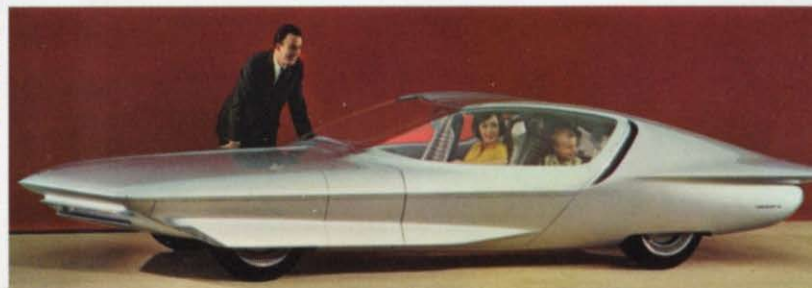
Firebird IV, latest in a series of turbine-driven experimental cars, promises new heights of comfort and convenience in automatic motoring.

Futurama will say to millions of visitors this year, "Here is a foretaste of tomorrow. Here, before you, is man roaming the moon, exploring Antarctica, working and playing beneath the sea, stretching a highway of progress and prosperity through the jungle and over the mountains, farming the deserts and creating a functional, beautiful new city. Here are triumphs of science and technology, but here—most of all—is man's abiding determination to make a better life for all."